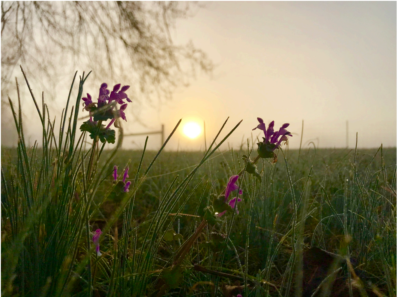
Image from resident near proposed quarry site