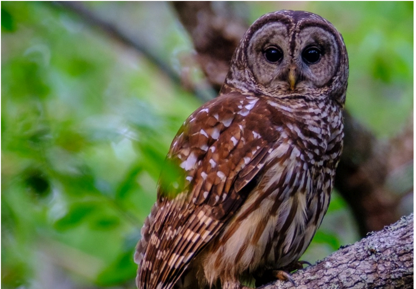
Barred Owl